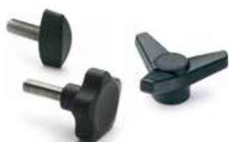
CT.476, VC.692, VB.639