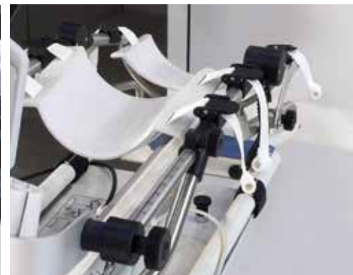
Clamping knobs and positioning elements in technopolymer and zinc-plated inserts.