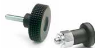
MBT., GN 607.2