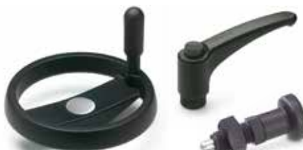
VRTP+I, ERX., PMT.100