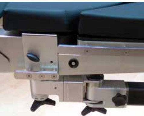
Clamping knobs and wing knobs in technopolymer with stainless steel inserts.