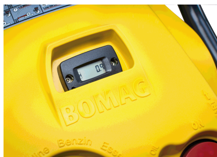
More transparency Hour meter RPM-meter with service indicator