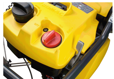
Simple operation Engine and fuel supply with combined switch