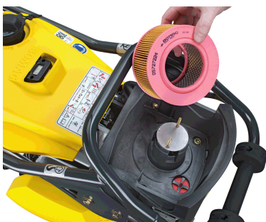
Maximum reliability and longevity All around engine protection