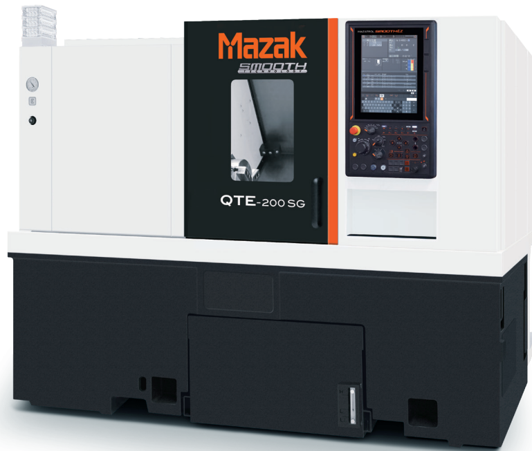
QTE-200 SG (500U)