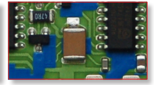
x6 zoom, 15x magnification