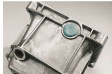
Ausbesserung eines Aluminium-Gehäuses Reconditioning of an aluminium housing