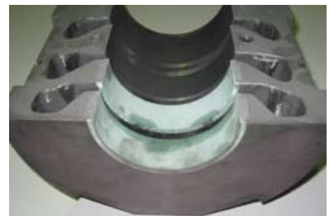
Reparatur von Dichtungsflächen im Gehäuse einer Labyrinthdichtung Repair of sealing surfaces in a labyrinth seal housing