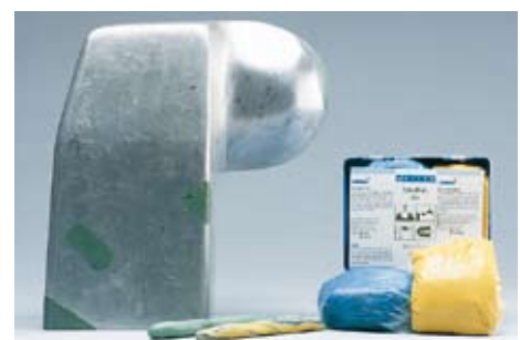
Musterteil Demo part

Any product specifications and recommendations given herein must not be seen as guaranteed product characteristics. They are based on our laboratory tests and on practical experiences. Since individual application conditions are beyond our knowledge, control and responsibility, this information is provided without any obligation. We do warrant the continuously high quality of our products being free from defects in accordance with and subject to our General Sales Conditions. However, our adequate laboratory and practical tests to find out if the product in question meets the requested properties are recommended. A claim cannot be derived from them. The user bears the only responsibility for non-appropriate or other than specified applications.