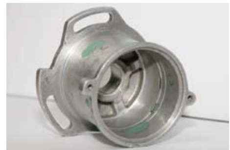
Musterteil Demo part