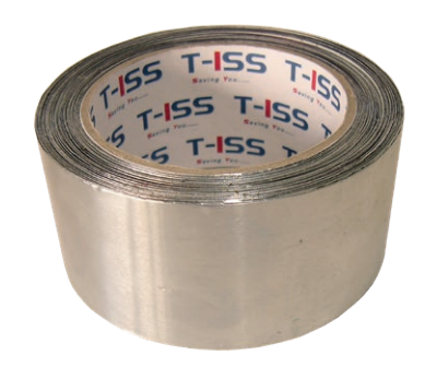
A roll of CorStop tape

The first product in our range of anti-corrosion tapes is our NOS A/S CorStop tape, which is available in the sizes 25 mm, 50 mm and 100 mm. The product works as follows; when two different types of metals, for example tubing systems, are attached to each other, it is very likely rust will arise between the two. By applying NOS A/S CorStop tape, the tape will have a sacrificing role in the oxidation process. Instead of the two metals that are attached to each other, the CorStop tape will oxidize and so protect the two metals. The same principle is put into practice on vessels; anodes are placed on the ship's hull. These anodes will rust instead of the hull which results in a hull that's rust-free for a longer period of time.