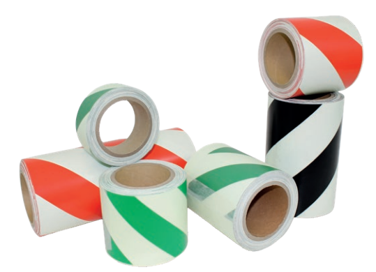
Several rolls of LightLine tape

Our range of LightLine tape consists of various photoluminescent tapes that are a great, proven method to indicate escape routes. All LightLine tapes comply with the IMO and SOLAS regulations, and have a Lloyd's Register approval. LightLine tape is offered in various reflecting qualities. Also, red, green and black striped versions are available. At last, we offer stickers that can be fixed to the tape which allows you to indicate staircases, escape routes, assembly stations and exits.