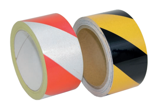
Two rolls of Reflective Zebra tape

The most striking product in our range of marking tapes is Reflective Zebra tape. This product is highly effective when it comes down to providing safety and protection. When compared to a white wall, this product is 200 (!) times more reflective. Combined with a red and white or black and yellow pattern, it's an outstanding and notable product. Therefore, it is an ideal product to prevent hazardous situations and accidents. When you are looking for a photoluminescent version of this tape, please look at our range of LightLine tapes.