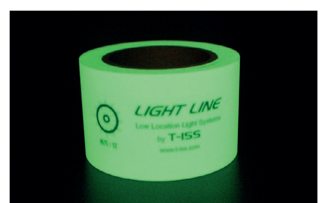
LightLine tape and its afterglow effect