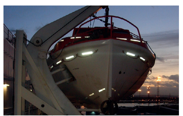
Retro Reflective tape applied on a life boat