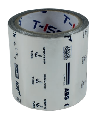
SprayStop roll cutted to 100 mm width

NOS A/S SprayStop is one of our best known products, and for a reason; SprayStop is the best, most certified anti-splashing tape on the market. SprayStop is a high-tech laminated multilayer aluminum tape that is designed to prevent dangerous spray-outs in tubing systems. Like you can imagine, spray-outs in engine rooms for example, can be highly dangerous. According to the SOLAS regulations, appropriate protection needs to be installed on these tubing systems. SprayStop meets these regulations which gives you a quick and safe solution that many people and organizations around the globe use and appreciate.