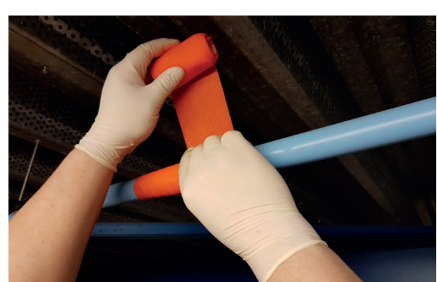
PipeRepair being applied