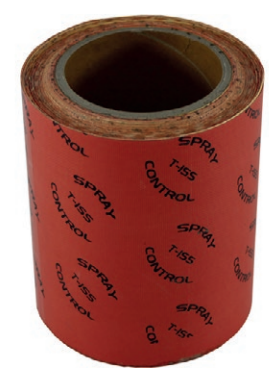
Close-up of a roll of SprayControl

SprayControl tape is very similar to SprayStop tape but differs in several points. First of all, the product is mainly used to protect chemical installations against spray-outs. SprayControl is a product that allows you to upgrade your safety situation according to pipeline systems on chemical plants. The tape prevents damages towards people, machinery and other pipes present in the area. SprayControl can protect chemical tubing systems that have a temperature between -30 °C and 75 °C, and will handle pressure up to 35 bar.