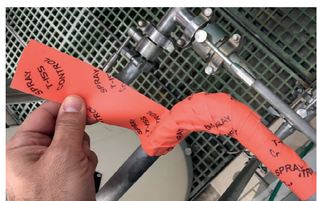
SprayControl being applied