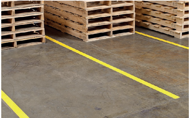
Floor tape applied on a warehouse floor