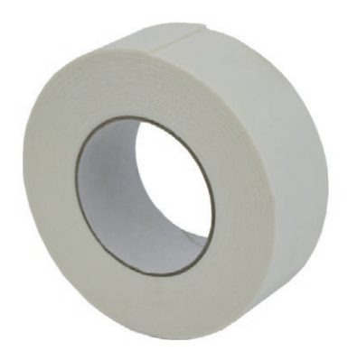
A roll of Foam tape

Foam tape is a no-nonsense product; it's an adhesive tape. But not just that; Foam tape is one of the strongest and sturdiest adhesive tapes on the market. It holds up to 1.8 kg / 25 mm which makes it an ideal product to permanently fix objects to a surface. Foam tape has a great chemical resistance which allows the tape to set in harsh weather and / or outdoor conditions. The product has a protective layer which means you can fix Foam tape to an object, and stick it on a surface later.