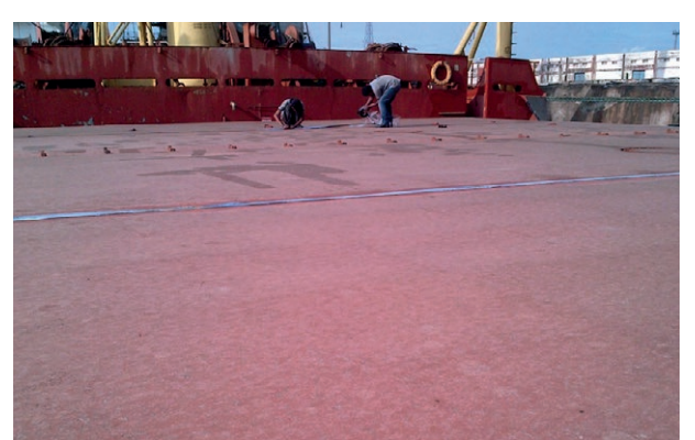
HatchCover tape being applied on a vessel