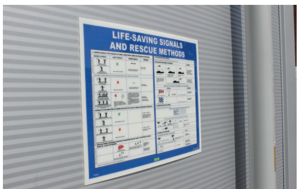
An IMO poster stuck on a wall using Foam tape