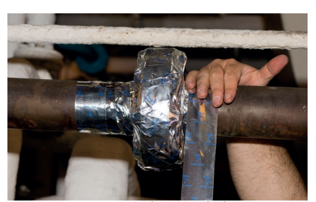
SprayStop being applied