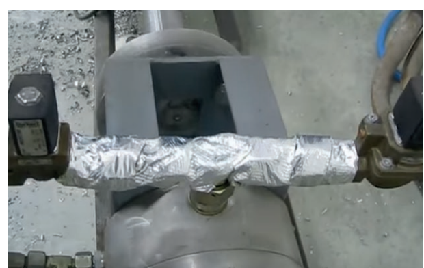
HeatStop applied on a tube