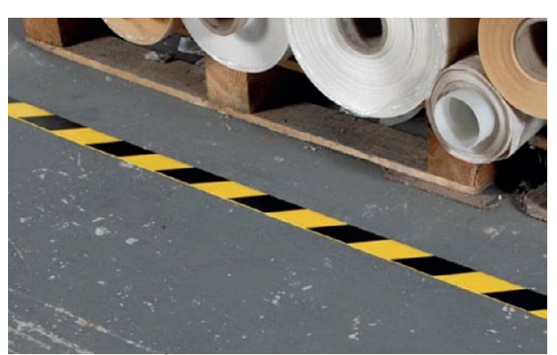
Reflective Zebra tape applied