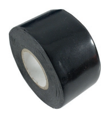
A roll of DripStop tape

DripStop is a very versatile product that can be used for various applications; an all-rounder. It's a very compact product that doesn't require any additional tools or products to use. The product itself can be installed without creating a mess; the product sticks to itself. So, it's easy to install and a versatile product. But what does it do? That's where DripStop tape excels; the product does several things. It will protect installations from leaks and splashing, will seal tubing that contains air or powders, but is also able to protect objects from corrosion or exposure to salts, water or weather conditions. It can be used to protect and insulate cables and will be a great help when it comes down to daily, versatile maintenance jobs.