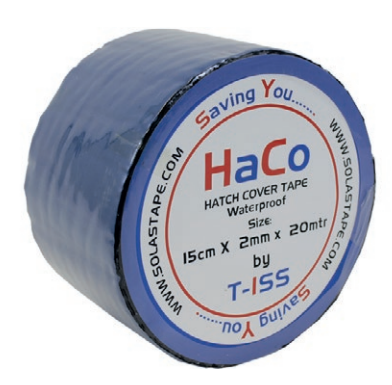
A roll of HatchCover tape

It goes without saying what the purpose of HatchCover is; the product covers up hatches on your vessel. Leakage on these hatches will lead to damaging your vessel or the cargo that's being transported. HatchCover will keep moisture out and ensures a tight seal that's weather-resistant. The product has an extraordinary strength, great adhesion and is very flexible. The blue color makes it easy to recognize which will prevent accidents from happening.