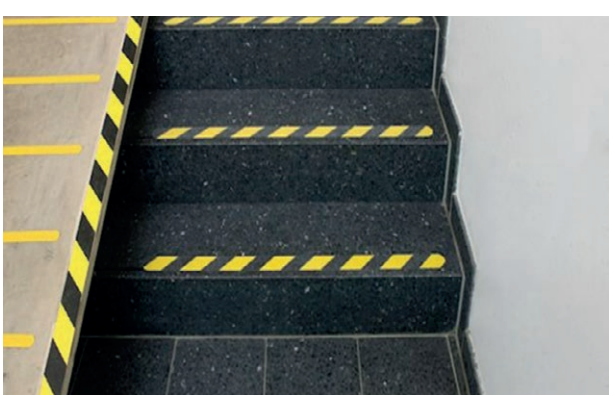
SlipStop tape applied on a staircase