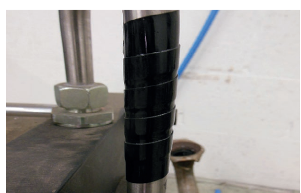
DripStop applied on a tube