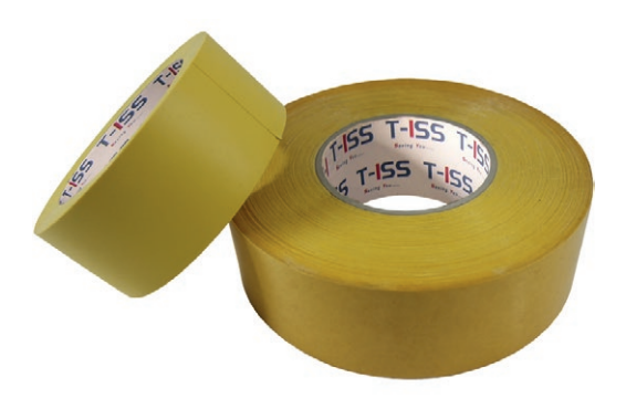
A roll of Floor tape

Ideal for warehouses and factory floors; NOS A/S Floor tape. This high-quality marking tape allows you to mark certain area's on your floor. For example; when you would like to mark an area where goods need to be unloaded, Floor tape would be the ideal solution. The product has an extremely good durability which means you can drive it over with forklifts, pump trucks and hand trucks no problem. The tape will hold up and areas will remain highlighted.