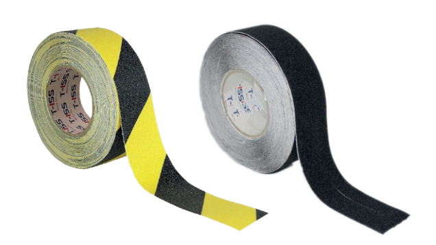
Two rolls of SlipStop tape

Mainly used as a product to stand out and prevent slipping, SlipStop is an ideal product in environments like staircases, walkways and areas that need to be marked. SlipStop can be used both in- and outdoors to prevent accidents and protect people against slippery surfaces. A simple product, but with extraordinary quality and durability. The tape is available in a low-profile black version, but also in a more striking Yellow / Black pattern.