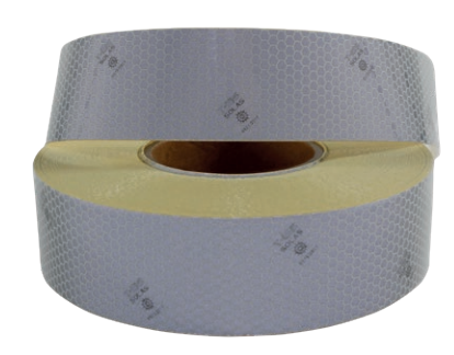
A roll of Retro Reflective tape

NOS A/S Retro Reflective tape, otherwise known as SolaxFlex tape, is a reflecting tape that uses an encapsulated lens sheeting. The lens ensures that the product is highly reflective over a wide range of entrance angles, whether dry or wet. This sheeting has a flexible and highly transparent film. Combined, these components result in an extremely bright reflection; one of the highest intensities available on the market. The product is praised for it's long durability, high brightness and anti-delamination.