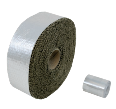
A roll of HeatStop tape

If you're looking for a product that insulates heat; look no further. NOS A/S HeatStop protects surfaces and lowers temperatures in a highly effective way. For example; a 180 °C tube will decrease to a temperature of 60 °C when HeatStop is applied. This is an extraordinary performance compared to competitive fiber tapes that will only cool down to a temperature of 95 °C. Also worth mentioning; HeatStop is produced using materials that are environmentally friendly for 100%. that replace hazardous glass and / or ceramic fibers that can be dangerous to your health.