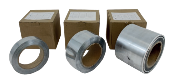
CorStop is available in 25, 50 and 100 mm width