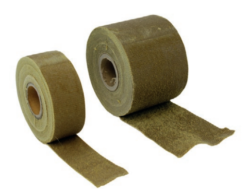
The two available sizes; 50 mm and 100 mm

NOS A/S RustStop tape consists of three main items, the base being a specially designed bandage. During the production process this bandage is processed with two more items; a high-quality rust-resistant mixture between oil and grease. Combining all these items results in RustStop tape. Tubing systems or other structures that are sensitive to rust can simply be wrapped with RustStop tape. Due to the oil and grease mixture in the tape the oxidation process won't have a chance to start, which means the tubing or structure in question will be protected.