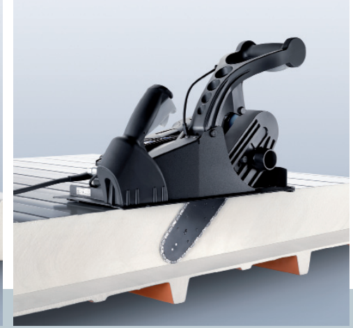
Single-sides cutting - one side of the sheet can remain uncut