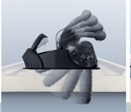
Immersion mechanism: the machine can insert into any spot in the material