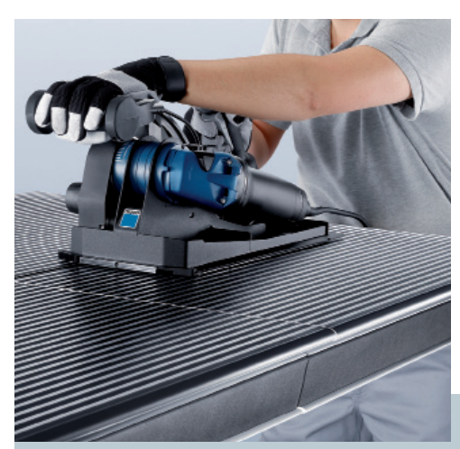
Right-angle cuts using a 90° adjustable blade.

With a 90 degree adjustable blade, you can easily and quickly produce right-angle cutouts. Another plus: as a result of its immersion mechanism, you can start at any location on the panel without a starting drill hole. This enables you to easily produce accurately dimensioned interior cutouts – even on mounted panels. And all this can be done in one operation, without finishing work and at a working speed of four meters per minute. The slide bars attached to the bottom of the support table also provide excellent machine guidance and reduce scratching on the sheet metal surface.