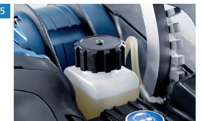
Integrated chain lubrication

Scale of 0 - 12. For adjusting the immersion depth of the blade.