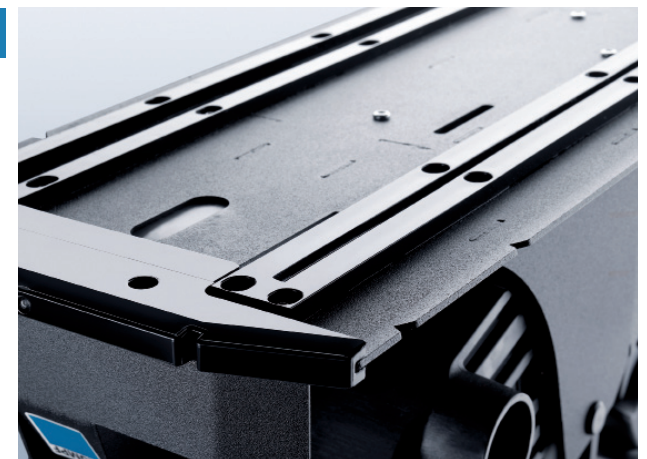
Slide bars & wear plates

The parts on the bottom of the support table are made of plastic and provide excellent machine guidance while reducing scratching on the sheet metal surface.