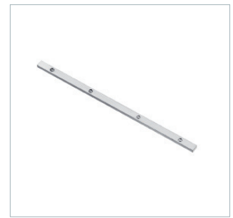
Connector piece for guide rail