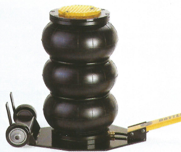
BA-88 Max Lifting State