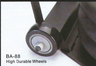
BA-88 High Durable Wheels