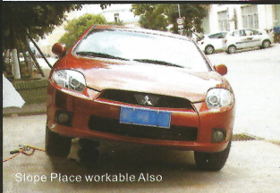
Slope Place workable Also