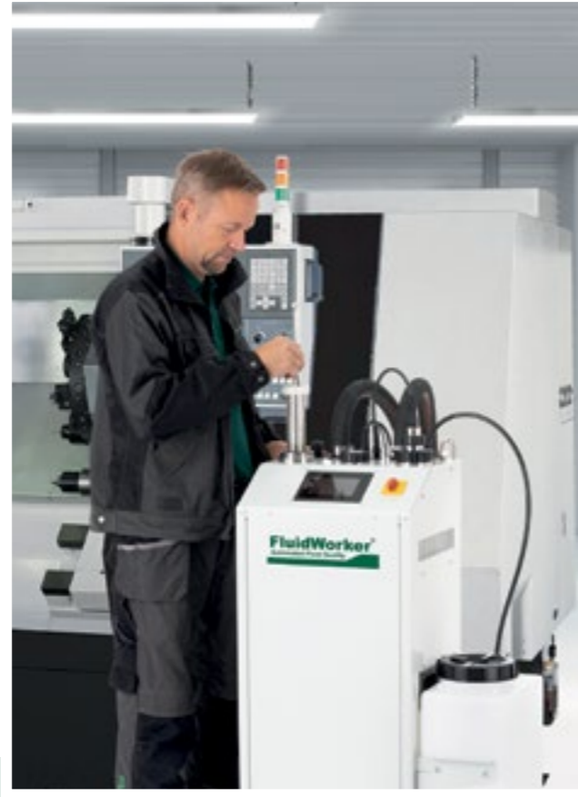
Fluid management automated by FluidWorker 150