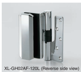
XL-GH02AF-120L (Reverse side view)

Passed 100,000 cycles of in-house testing