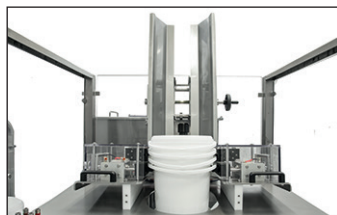
The bucket dispenser can be complimented by a bucket buffer.