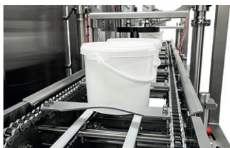
V-Shaped carriers makes the machine handle multiple bucket sizes

A series of optional equipment can be added to the Primodan filling machines depending on the desired hygienic level and which products the machine should handle. By adding features like Pulsed light sterilization of buckets, lids, MAP (Modified Atmosphere Packaging) solutions and HEPA filters to the machine, the machine enters the ULTRA CLEAN hygienic level and becomes suitable for filling particularly sensitive products.