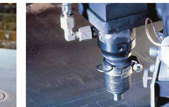
The optional high frequency punch marker permits accurate marking of points and lines.