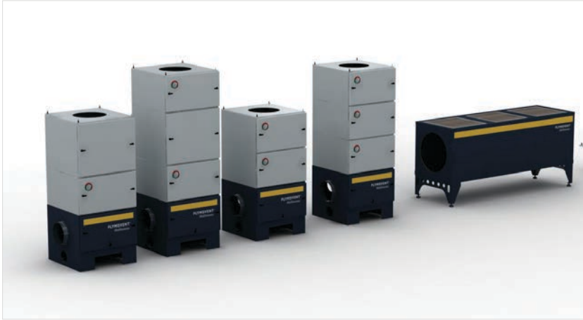
ME-31 ME-32 ME-41 ME-42 Filter bank for 3 units

The MistEliminator is modular and can be tailored to your needs in capacity, media and efficiency. It all depends on the choice of initial investment vs. operational costs. Whether you produce small or large amounts of oil mist or oil smoke, whether you work a few hours per day or continuously, whether you need to recirculate or channel to the outside. The MistEliminator from Plymovent suits any work environment!