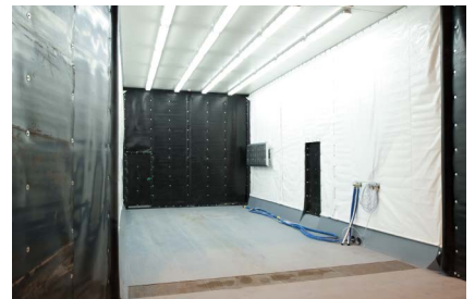
White tarpaulin and dustproof, high efficiency lighting on the inside