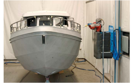
Movable platform for operator