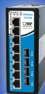
PROmesh B12 PoE