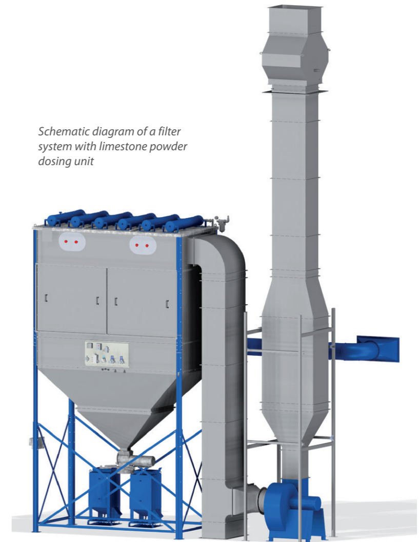
Schematic diagram of a filter system with limestone powder dosing unit

The single components can be retrofitted in existing booths, for example your blastroom, so that investing in a complete system including booth housing is not necessarily required.