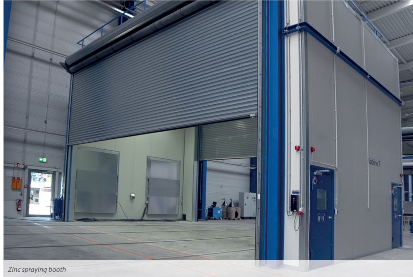
Zinc spraying booth

the respective workpieces, are equipped with a filter system specially developed for this process, including limestone powder dosing unit.