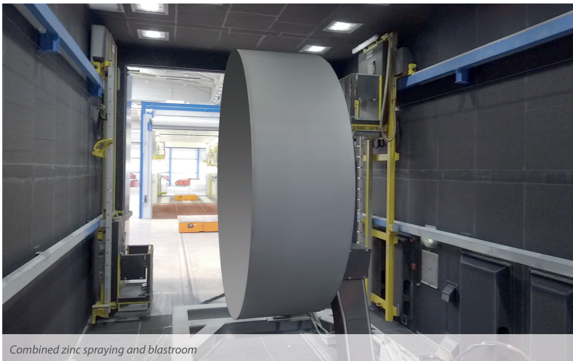
Combined zinc spraying and blastroom