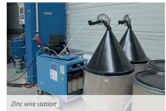
Zinc wire station