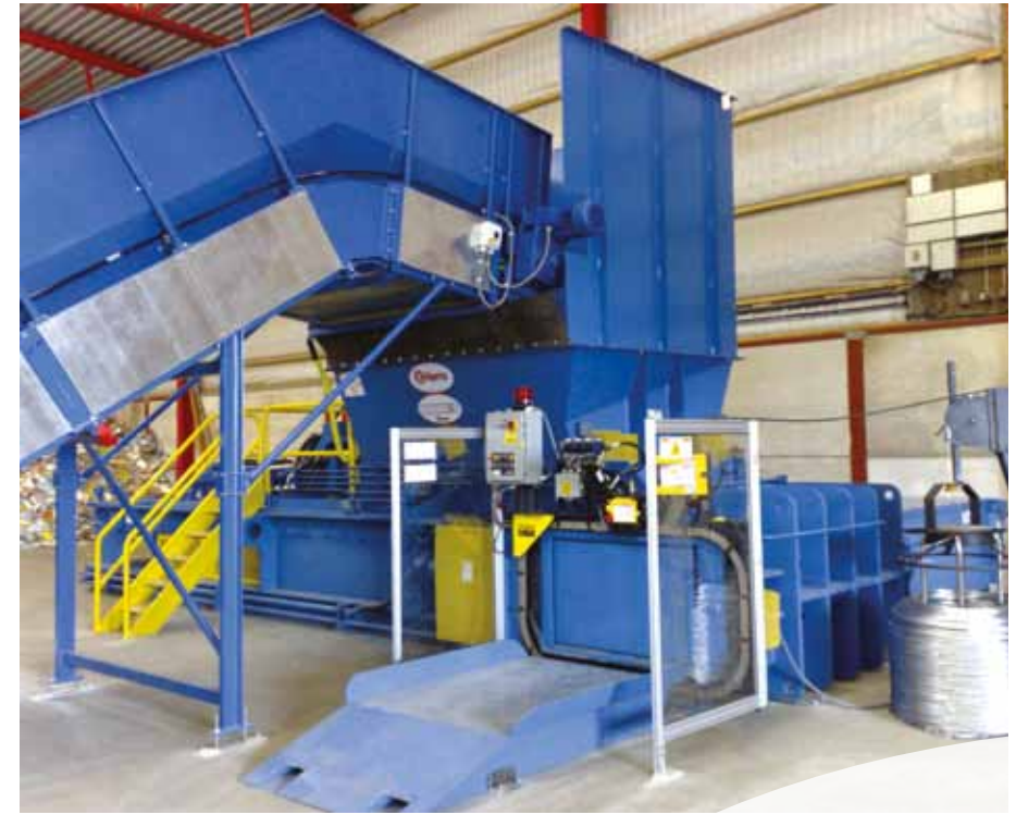
Harris Centurion baler 150 hp. Ram force 210 t. Infeed hopper 2184x2908 mm. Can be used for e.g. OCC, tyres, hard plastic, non-fe, wood, MSW.

The purpose of baling is to reduce freight costs or to decrease the space needed when materials and waste are stored on e.g. landfills.