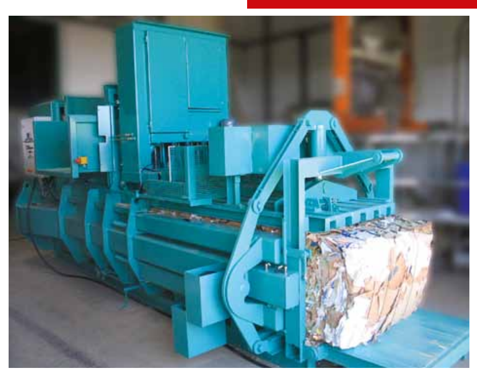
ABBA channel baler 500V5. Ram force 50 t. Can be used for e.g. pet, foil, OCC, big bags.