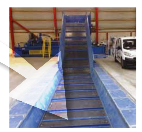
Final installation combining a Centurion 2-ram baler with a 2 m wide conveyor infeed system.

Beyond the examples mentioned here we have several solutions for: