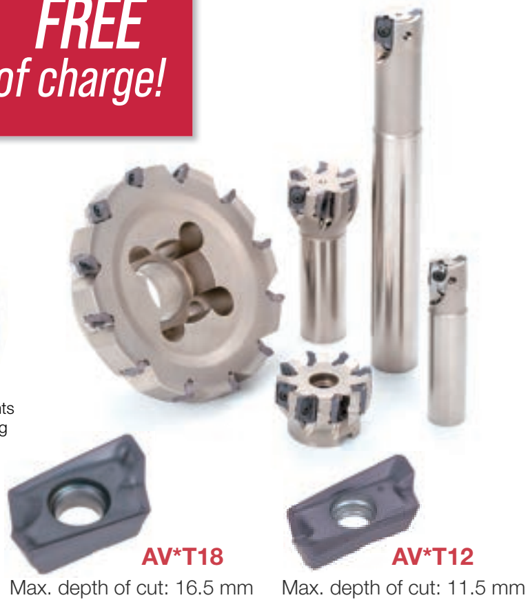
AV*T18 Max. depth of cut: 16.5 mm AV*T12 Max. depth of cut: 11.5 mm

V shape design prevents insert movement during machining.