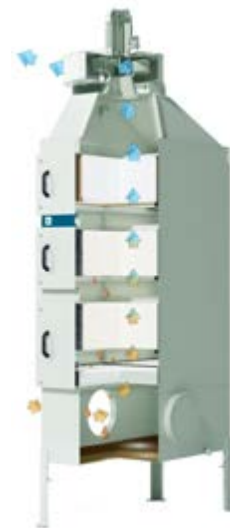
This picture illustrates the drainage process in our FibreDrain™ filters.

The airstream enters at the bottom of the filter unit and passes upward through the filter cartridges. The filter stack is progressive in filtration properties, which means that the smaller the particle, the further it will penetrate the filters in the air flow direction. The captured mist drains from the filter surface by gravity down in the sump of the collector.