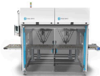
MF Visio Series