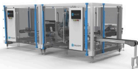
MF Lite Series

The MASPE philosophy and approach is to create Modular, Flexible, Automation creating a wide range of solutions to meet the specific requirements of our customers, achieved by adapting our core designs. We provide multi-functional machines which can be integrated with other functions such as; Forming, Filling and Closing.