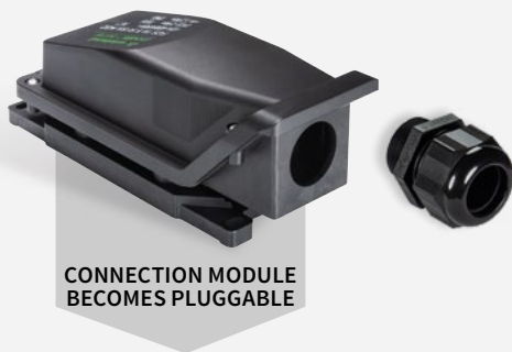
CONNECTION MODULE BECOMES PLUGGABLE