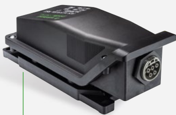
7 CONNECTION MODULE RST25 connection module with integrated pluggable connection to the 5-pole RST® system.

For pluggable outlets to the charging stations, replace positions 4, 5 and 6 with position 7 and one of the positions from 8 – 13.