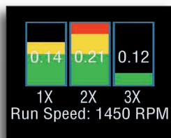
Display on vibrometer unit. Analyze.