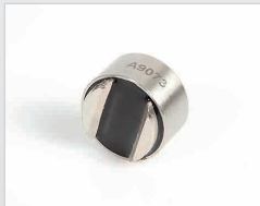
Magnet, Part No. 03-1327

*Please see www.easylaser.com for compatible models.