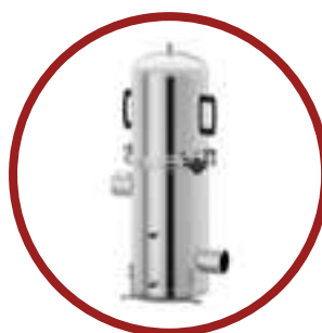
ME Multi Code 7