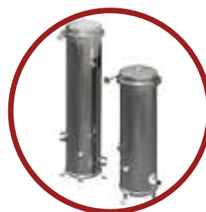
DS Multi DOE