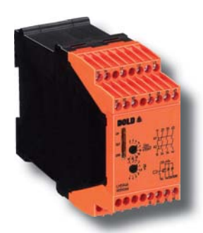
Standstill Monitor LH 5946

Cat. 4 / PL e according to DIN EN ISO 13849-I SIL CL 3 according to IEC/EN 62061 SIL 3 according to IEC/EN 61508, IEC/EN 61511 and