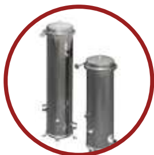
DS Multi DOE