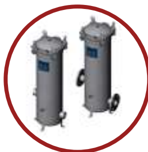
FWK Multi DOE