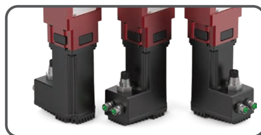
Motor connection positions can be rotated in 90° increments

Drive motors can be ordered in an inline (straight) or a redirected configurations