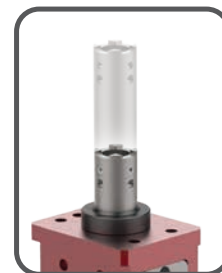
Adjustable stroke up-to-60mm