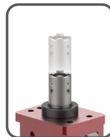
Adjustable stroke up-to-40mm *Straight motor option only.