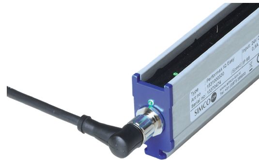
Separate connector, straight or angled