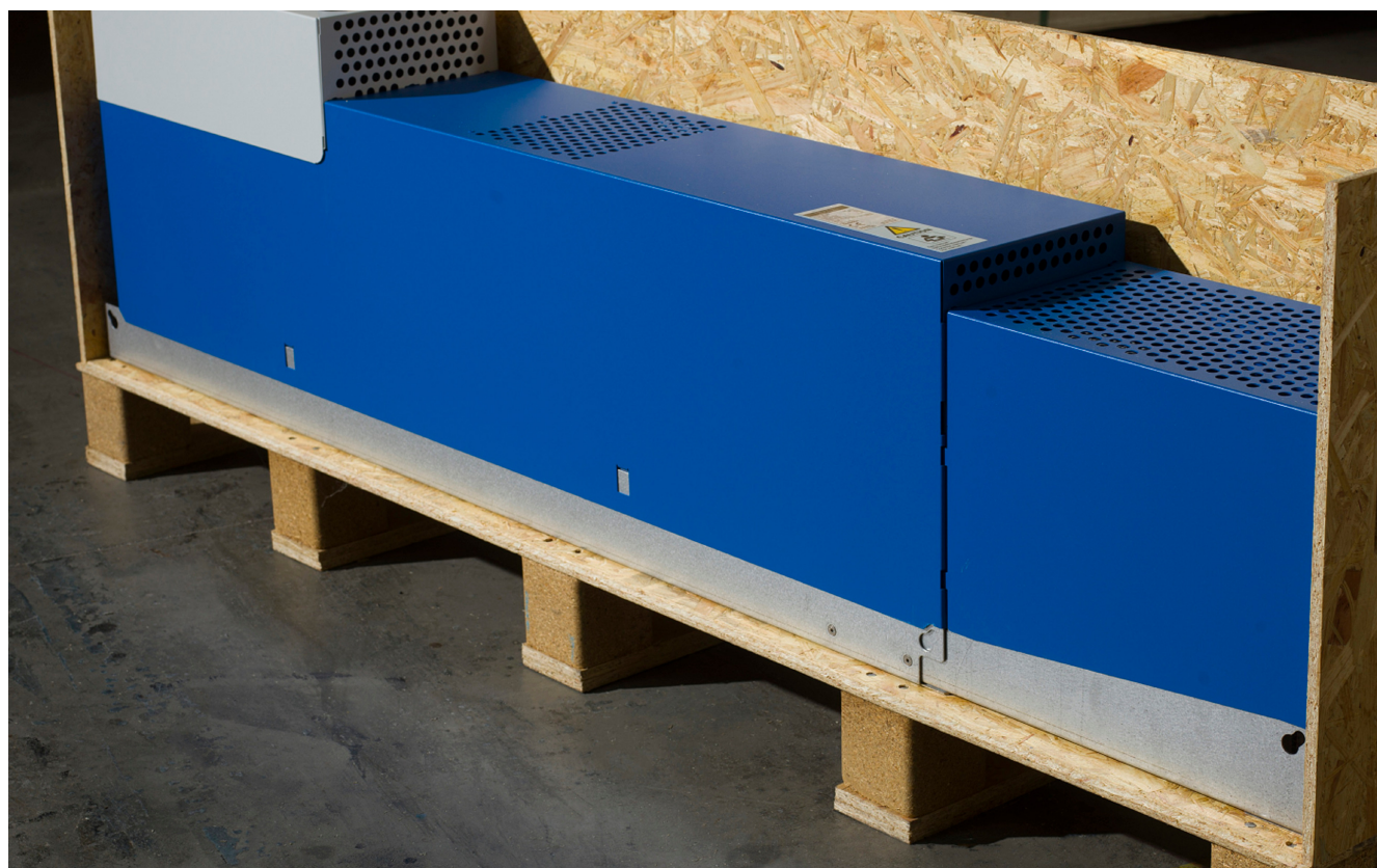
The Clip-Lok Expendable box loaded with two power quality units and bolted at the pallet base.