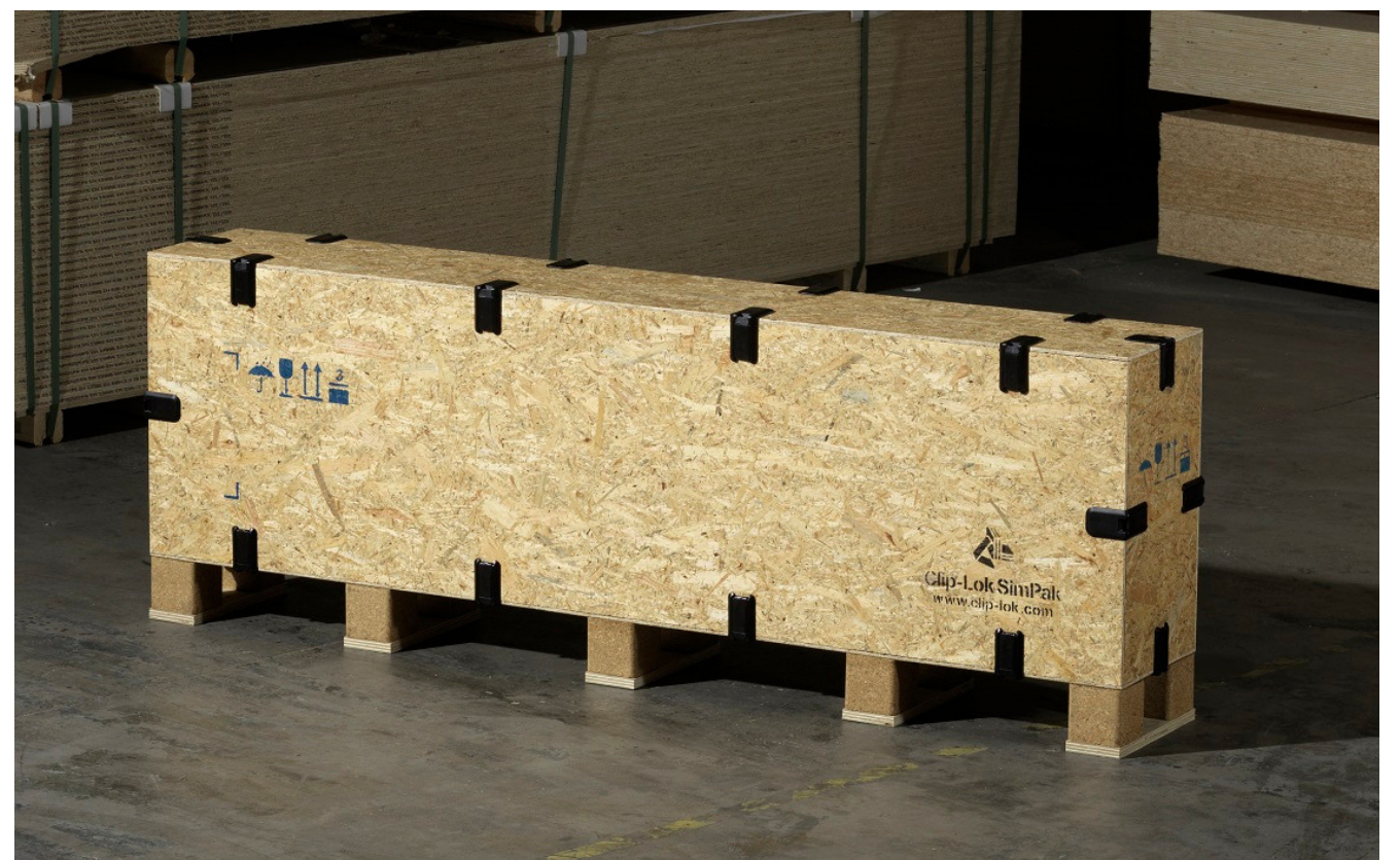
Clip-Lok Expendable box built up and loaded with power quality units ready for transport.