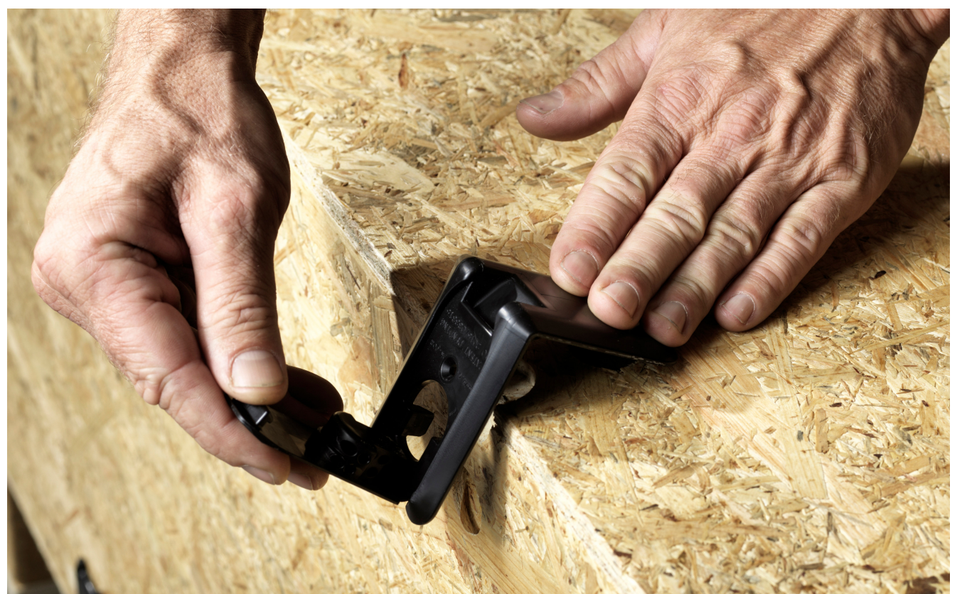
Clip-Lok QIK Plastic clip requires no tools while assembling or disassembling the box, ensuring a tool free environment.