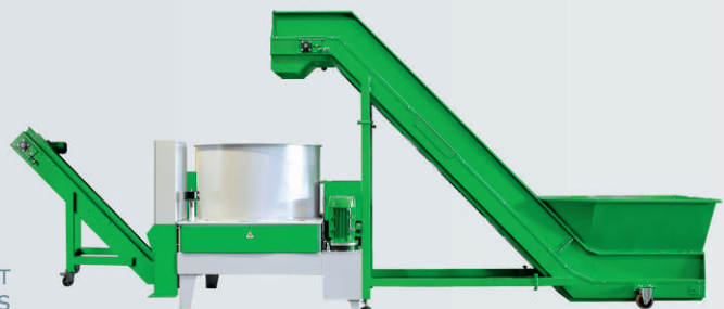
BRIQUETTING PRESS PLANT WITH CONVEYORS