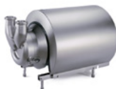
MR Liquid ring pump