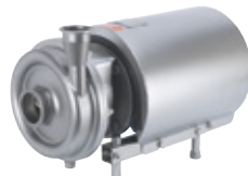
LKH-I High Inlet Pressure