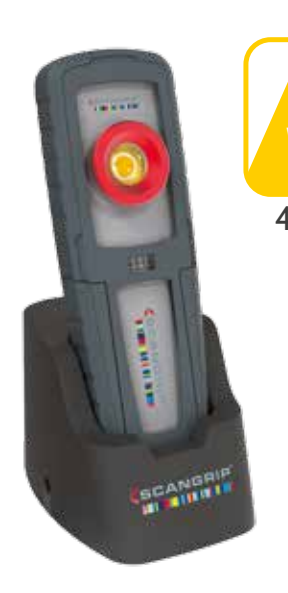
SUNMATCH 2 € 169

Ultra high CRI+ COB LED 96 CRI+ 4500 KELVIN 1100/550 lux @0.5m (step 1/step 2) 400/180 lumen (step 1/step 2) 1h/3h operating time 4h charging time 3.7V/2200mAh Li-ion IP65