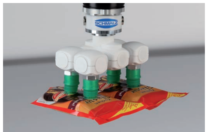
Vacuum end effector with bellows suction pads SPB4 for stand-up bags