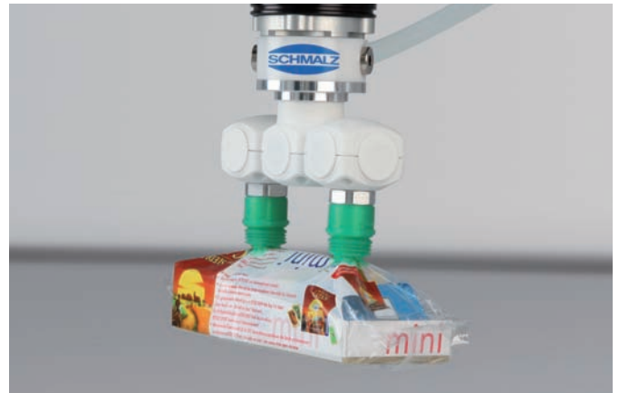
Vacuum end effector with bellows suction pads SPB4 for flow-wrapped packaging