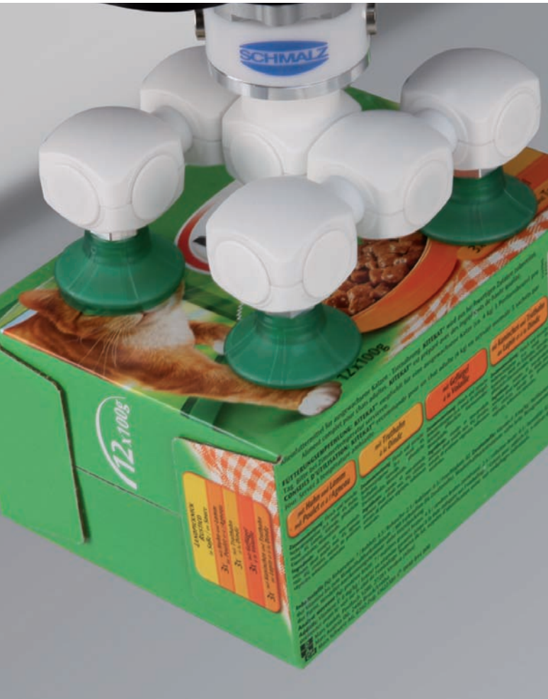
Vacuum end effector with bellows suction pads SPB1 for cardboard packaging