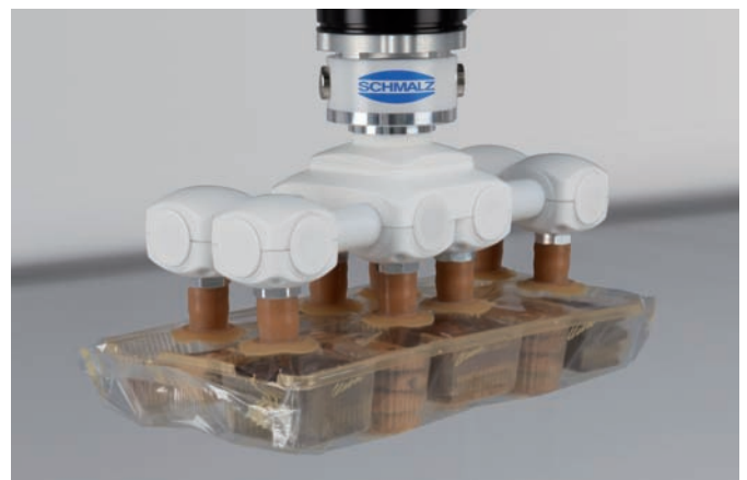
Vacuum end effector with flat suction pads SGPN for firm foil packaging