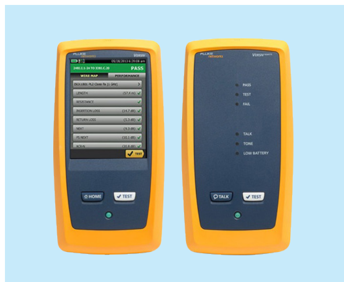
Cable tester ETHERtest V5.1