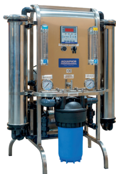
Image of RO-M 300