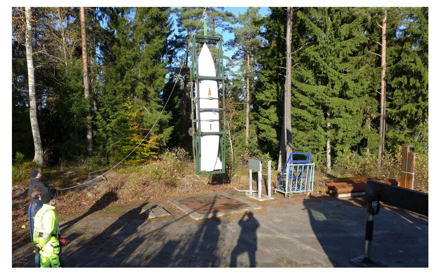
A drop test being conducted on Clip-Lok Steel Rack loaded a droptank in an external environment