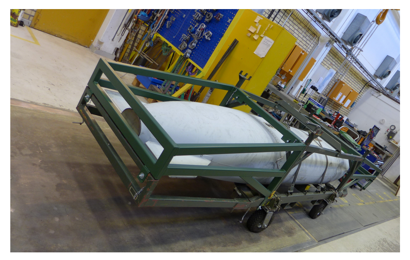
No damages or leaks detected in the droptank after the drop test was conducted by an internationally accredited test institute