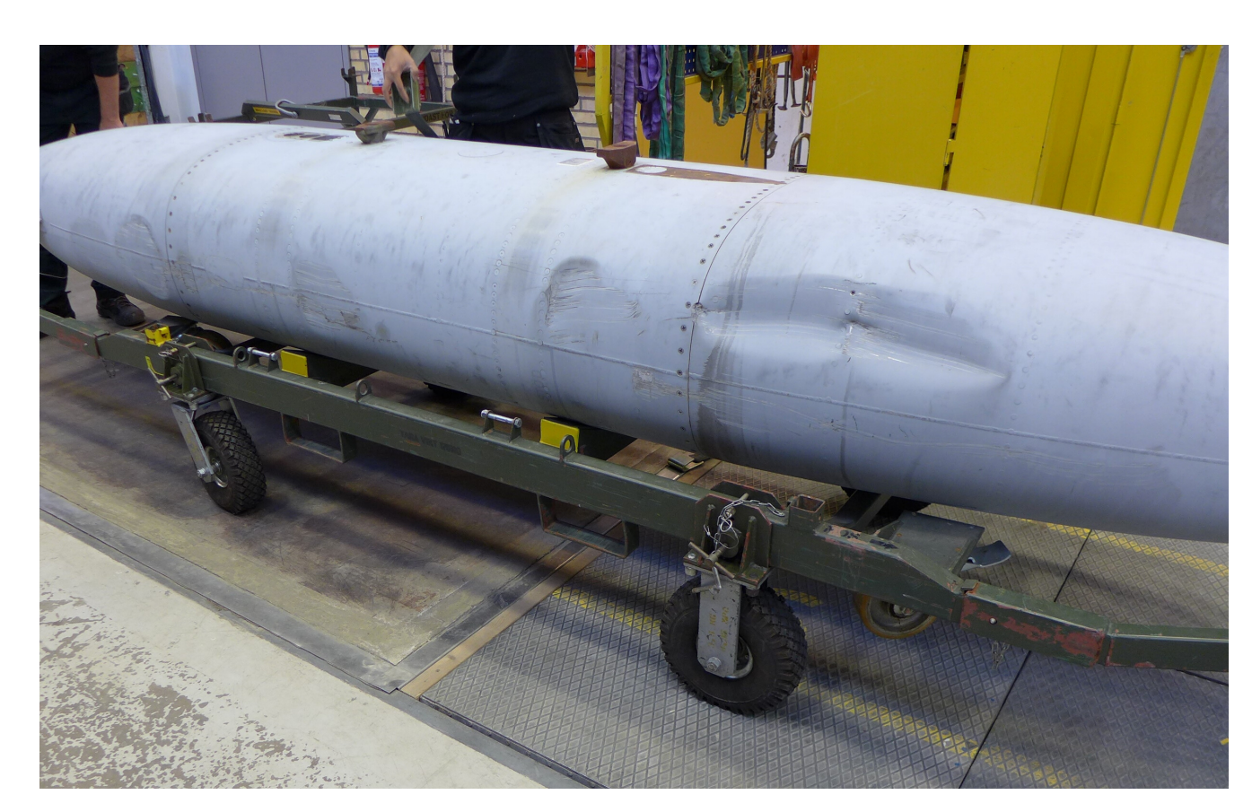
A droptank with aviation jet fuel brought on the existing under carriage ready to be mounted with Clip-Lok steel rack.