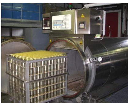
Highest requirements: Polystone® P SSAG layer pads must stand high temperature, pressure and steam in autoclaves used for the food sterilization process