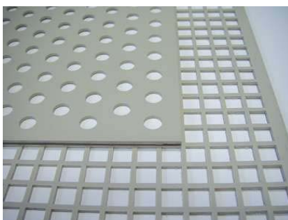
Flexibility: Round and square holes in different sizes and pitches are possible

We offer to you our experience in perforation. From the initial idea to the final specification, we will be your partner with the design offering our advice.