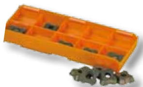
Art. Nr. 26109