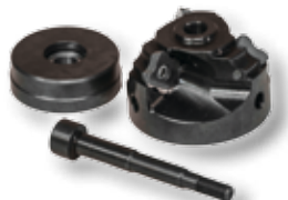
Art. Nr. 27234