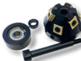
Art. Nr. 27223