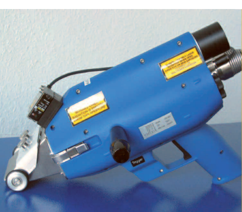
Laser optics OS H 50 for manual application

Cleaning with laser light – environmentally friendly, precise and profitable. Please contact us to discuss your application and discover what's possible when you clean with light and CleanLASER Systems.