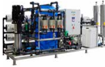
Image of RO-HC 12000