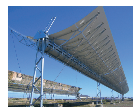
Sections for solar thermal power plants should be able to withstand heavy loads and be easy to maintain.