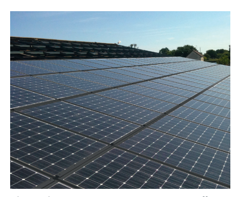
Photovoltaic structures require sections offering a long service life, which are easily assembled.