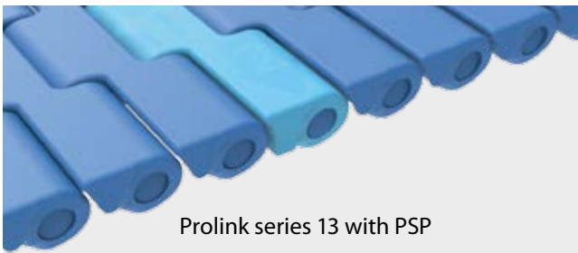
Prolink series 13 with PSP