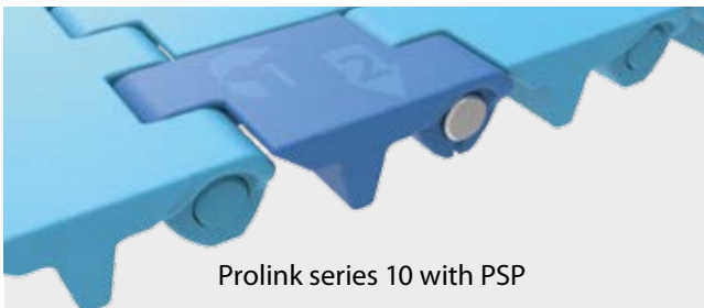
Prolink series 10 with PSP

Pitch 14 mm (0.55 in) | For lightweight to medium-weight products (food and other items). QR code for film