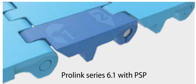
Prolink series 6.1 with PSP

Pitch 25.4 mm (1 in) | For lightweight to medium-weight products in hygiene-critical applications. QR code for film