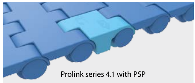
Prolink series 4.1 with PSP

Pitch 8 mm (0.31 in) | For lightweight to medium-weight products (food and other items), as well as applications with knife edges. QR code for film