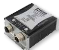
Emparro67 – Power Supply Units, single phase