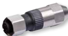
V2A M12 Mosa with IDC technology