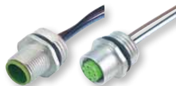
M12 Flange Connectors