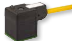
MSUD valve plug connector