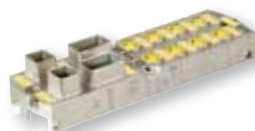
MVK Metal Safety