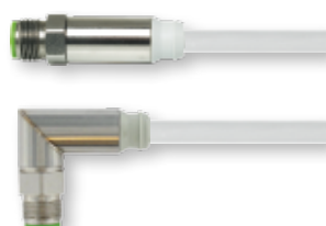
V4A connector M12, straight and 90°