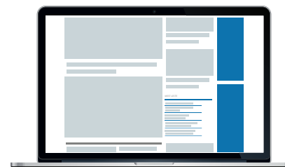
Sky 1, 2

Type: W: 180 px x H: 500 px Mobil: W: 468 px x H: 150 px Size: max. 90 kB