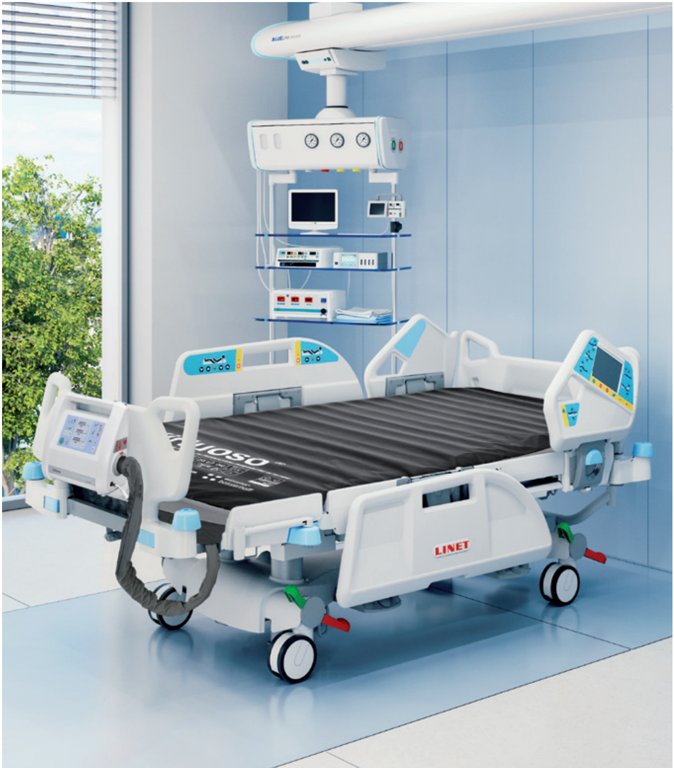
Critical Care Bed