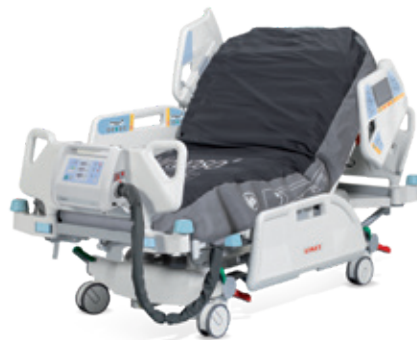
Virtuoso with zero pressure and 3-cell technology.

Multicare open architecture allows using various mattress systems for the prevention or healing of pressure ulcers according to the needs of the patient.