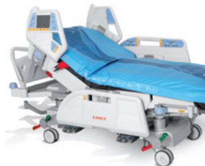
OptiCare with integrated design.