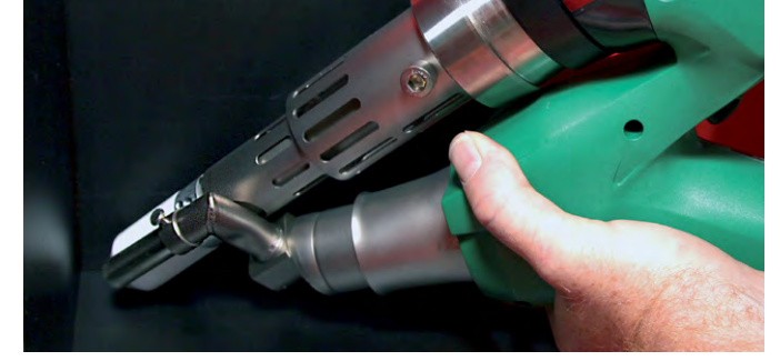
Full control, even in cramped conditions with very little light.

ECTFE) – at all times. The ergonomic design, which offers several grip positions and holding options, allows you to work in comfort in areas that are difficult to access.