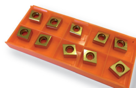
Art. Nr. 27231