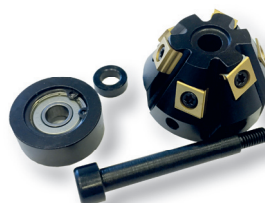
Art. Nr. 27233