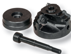
Art. Nr. 27234