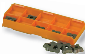
Art. Nr. 26109