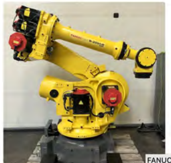
FANUC R-2000iB 165F