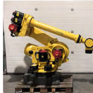
FANUC R-2000iB 125L