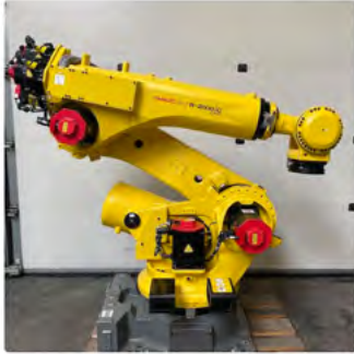
FANUC R-2000iC 270F