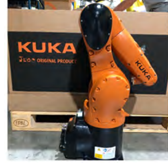
KUKA Agilus KR6 R700 NEW