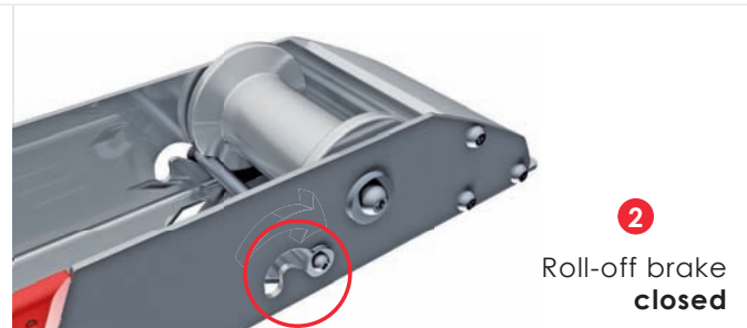
2 Roll-off brake closed