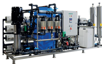
Image of RO-HC 12000