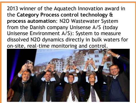
2013 winner of the Aquatech Innovation award in the Category Process control technology & process automation: N2O Wastewater System from the Danish company Unisense A/S (today Unisense Environment A/S): System to measure dissolved N2O dynamics directly in bulk waters for on-site, real-time monitoring and control.